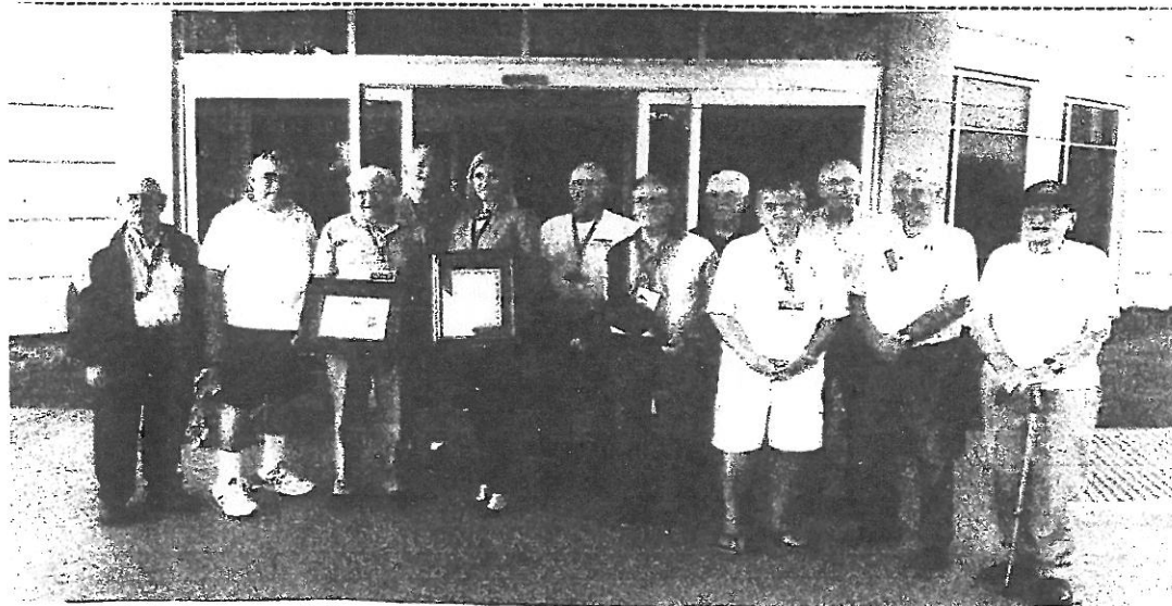
USS Calvert and Navy Veterans – 2015 Reunion in Fort Worth, Texas (Receiving Dedication and Texas State flag from Irving, Texas Mayor)