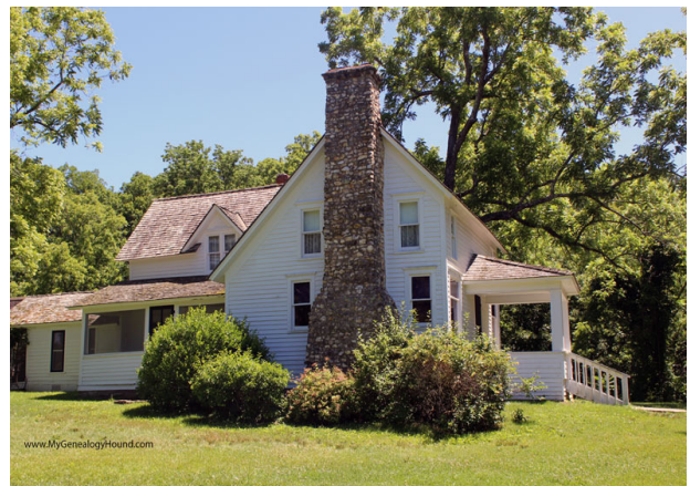
Rocky Ridge Homestead, home of of Laura Ingalls Wilder, Mansfield, MO