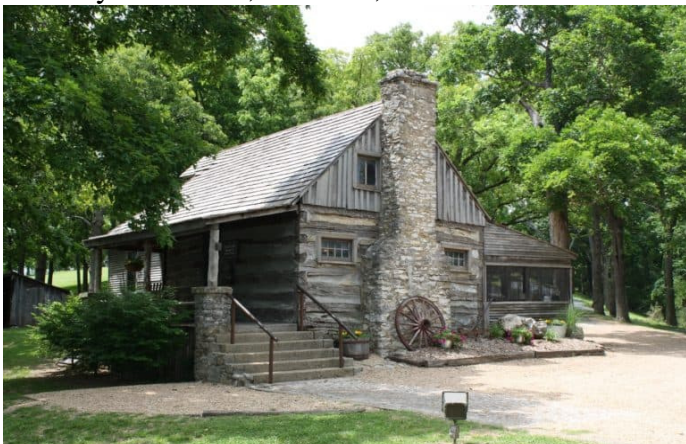
Uncle Matt's Cabin, Shepherd of the Hills Homestead, Branson, MO