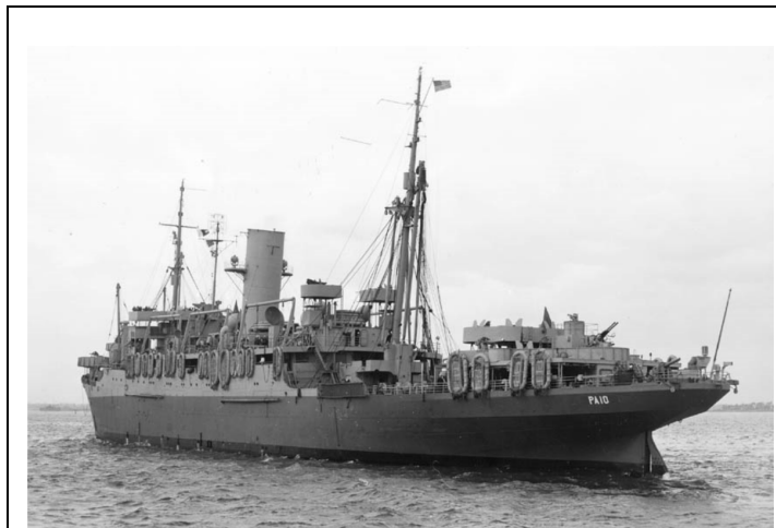
USS Harry Lee (APA-10)