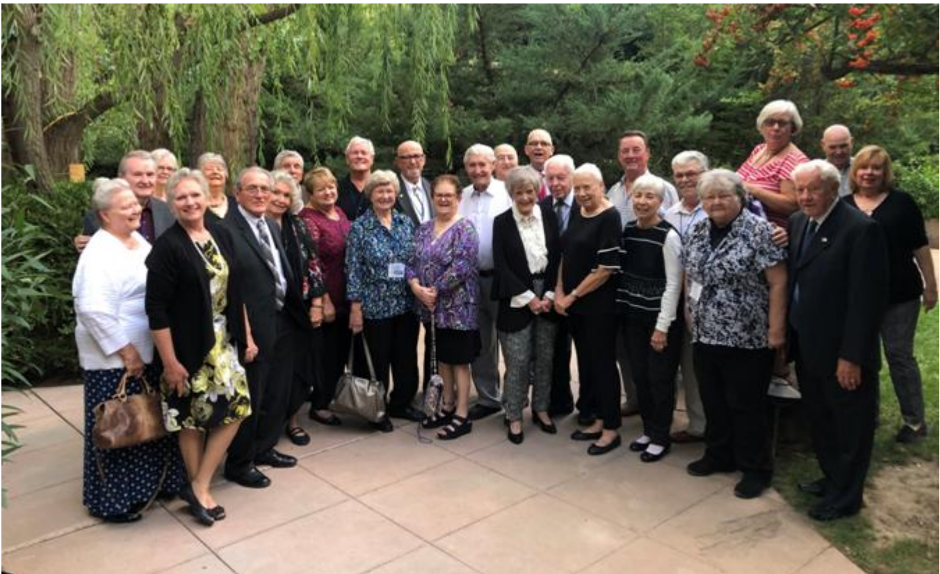
USS Calvert Reunion, Albuquerque, NM. Photo taken outside El Pinto Restaurant, Albuquerque, NM, September 21, 2019